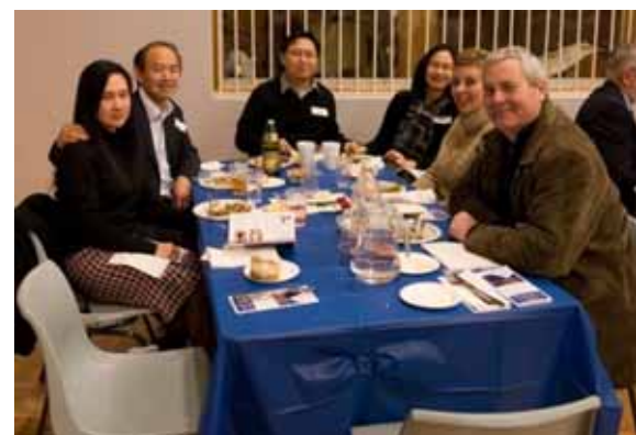
At the Inaugural Dinner – 30 June 2007

Praise God for the opportunity to present the truth about life to impressionable children.