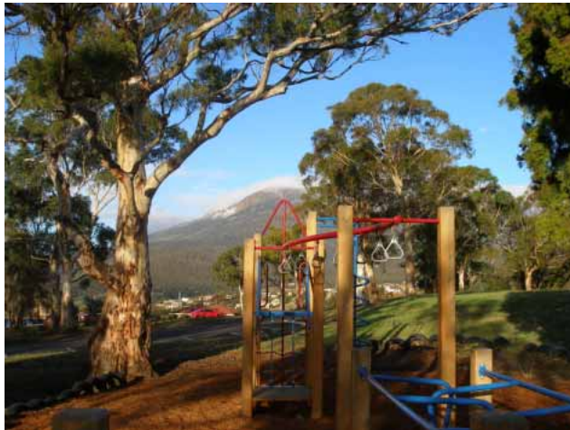
Mount Wellington as a backdrop to Hilliard Christian School

Contact CoL if you want multiple printed copies of Choice News for your church, work place or friends. Please feel free to email the Choice News to those on your contact list.