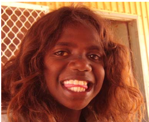
Young girl from Manmoyi in NW Arnhem Land