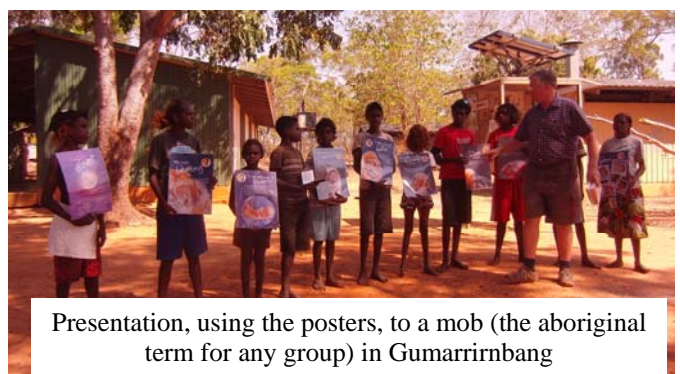
Presentation, using the posters, to a mob (the aboriginal term for any group) in Gumarrirnbang

It has been suggested that the posters, or video presentations of the information, could be made available to Health Workers and Community Health Clinics in the Northern Territory for use in pre-natal education. Because of cultural sensitivities in many communities a male would be precluded from speaking about such issues. In one area it has been noted that even the women will not talk at all about the baby or the pregnancy until he/she is born. The development of these resources is important but must be done respecting the cultural values of those we are trying to reach with this message.