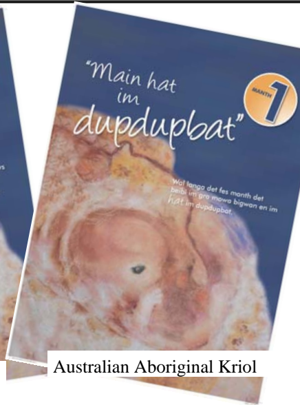
Australian Aboriginal Kriol