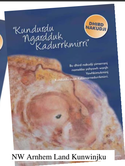
NW Arnhem Land Kunwinjku

The series of 10 posters (conception to birth) has been used in schools across Australia for the past 10 years. The attractive pictures and the detailed descriptions have provided students with an amazing picture of life in the womb. In 2010 during the visit to Darwin it became evident that the detailed descriptions needed to be simplified. With the expert assistance of Dave Glasgow , a long term translator and missionary with SIL (Australian Society for Indigenous Languages), the 'easy to read' English posters were completed.