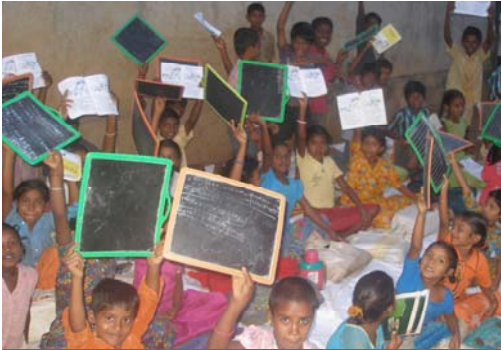
Books and slates in the Literacy Centre