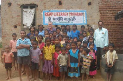
REAP Literacy Centre in West Godavari