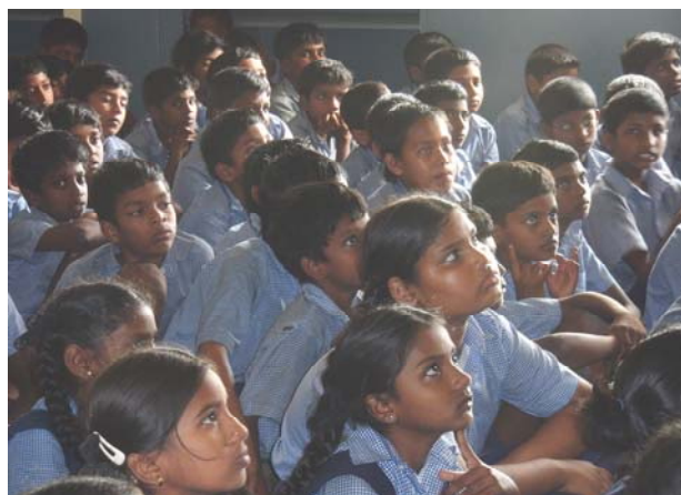
Bethany Primary School, Chennai

of their church in Mackay, Queensland. This was an extremely valuable time for all the teachers involved. Many of them have never had any formal teacher training and REAP is keen to develop this area