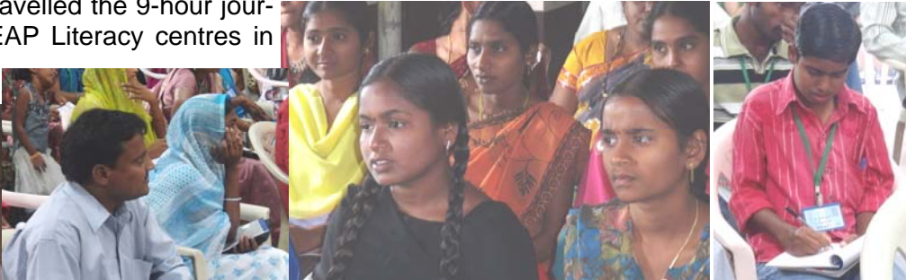
Literacy Centre Teachers