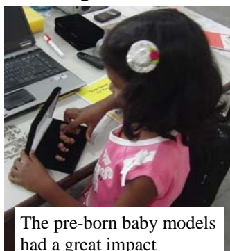
The pre-born baby models had a great impact

The goal is now to seek financial resources to enable the provision of the foetal models for each centre. In addition the simplification, trans-