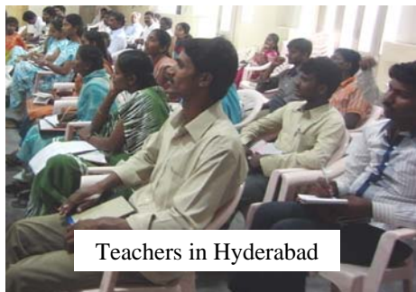
Teachers in Hyderabad

For two days all the teachers from the Literacy Centres— approximately 50 in a central location