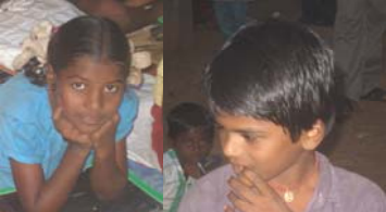
Literacy Centre Students

The following day Bruce travelled the 9-hour journey to visit five of the REAP Literacy centres in West Godavari. Some