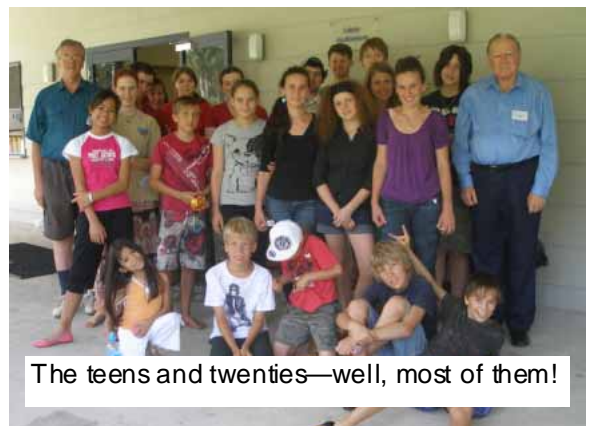
The teens and twenties—well, most of them!

God made special mention of the sin of the slaughter of the unborn, which He states "I did not command, nor did it enter my mind" (Jeremiah 7:31; 19:5; 32:35). We may be quick to condemn the barbaric practice of child sacrifice but our nation condones abortion – we are really no different!